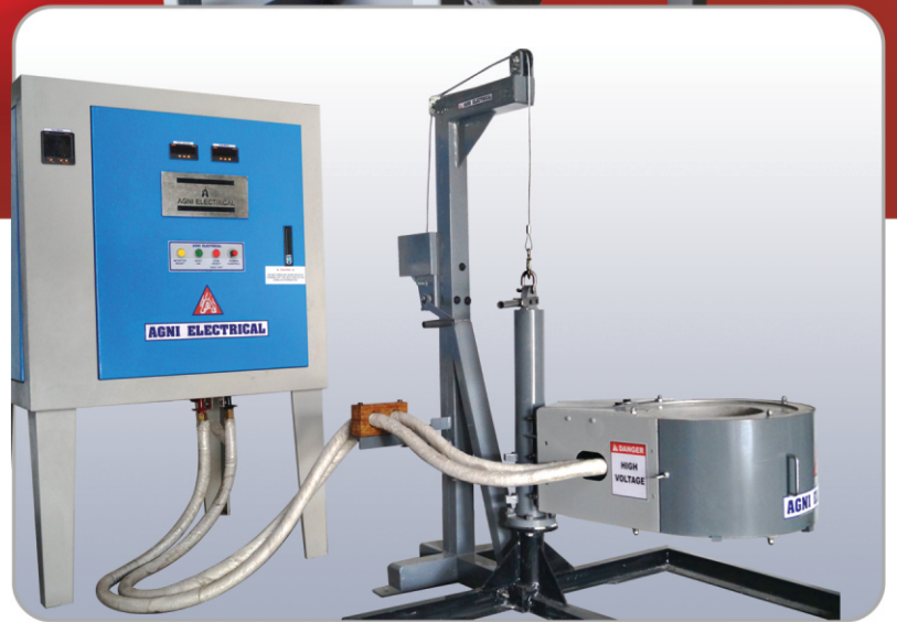
Lift Swing Crucible